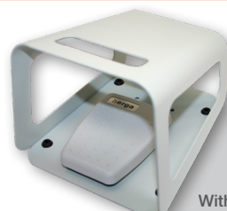
With 6202 Guard